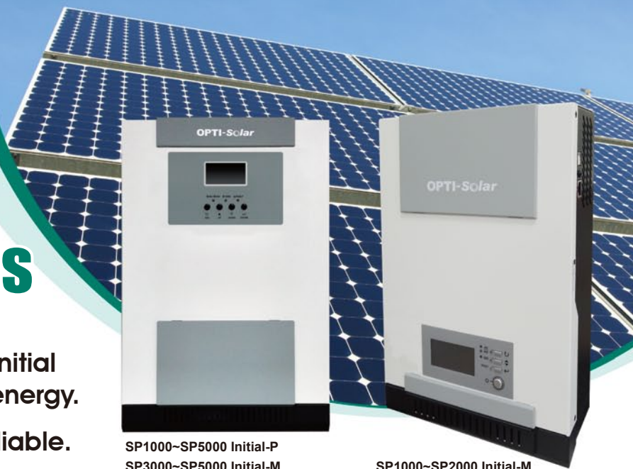
SP1000~SP5000 Initial-P SP3000~SP5000 Initial-M